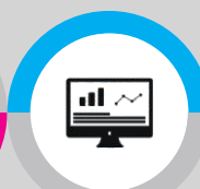
Reports & Analytics

• INCREASE PROFIT • REDUCE COSTS • WIN CUSTOMER • SAVE TIME