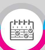
Attendance & Payroll