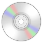
Operating System Appliance Solution