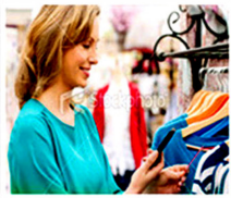
Apparels / Garments Retail Showrooms

ERP for Garments Retail Stores to manage Billing, Accounts & Stock With Barcode Tags