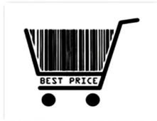
Barcode Labels Ultimate Designs

Maintain Item stock of tiles with batch No., Serial No., Shade along with all stock reports. Ready to reach to automation