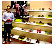
Footwear / Shoes Outlet Automation

ERP for Garments Retail Stores to manage Billing, Accounts & Stock With Barcode Tags