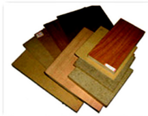
Plywood / Laminates Dealers/Distributors

10 Minutes Implementation time, User Friendliness & zero Training cost has made world's best software to open world class retail outlets