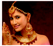
Artificial Jewellery Retail Outlets

Maintain Stock Under different Articles No.'s, Different Shades / Colors, Different Sizes are very Simple With ERP