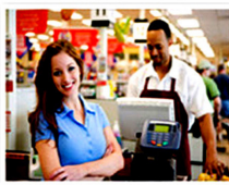
Point of Sale(POS) Billing/Invoicing

Now Design any type of barcode labels without barcode printer. Use A4 Sticker sheet to print economical barcodes with your laser printer